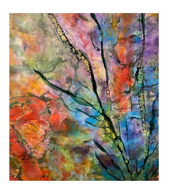
Pushing Boundaries: A Contemporary Show in Encaustic pictured above, Outback Burning by Richard Coico