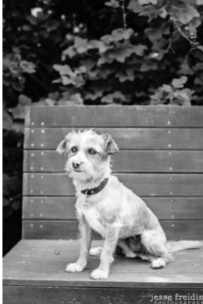
Jesse Freidin Intro to Dog Photography June 1 – 5

Website Building for Artists June 8 - 10