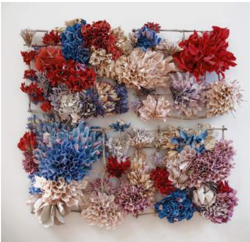
Rebecca Hutchinson Handbuilding Personally Reflective Forms

Our online workshops take advantage of virtual meeting platforms such as Zoom and Facetime for class demos, discussions, and critiques. Visit us online for full workshop details: www.castlehill.org/workshops