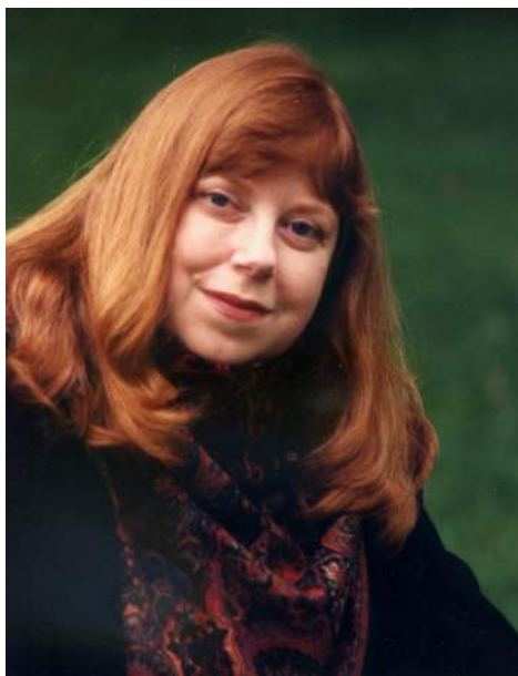
Kathryn Kulpa Flash Fiction: Prose Distilled June 15 - 19