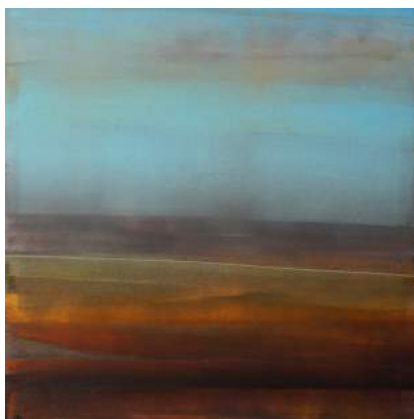
Carol Pelletier Working With Cold Wax Medium June 22 - 26