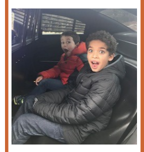
April 24th Truro Central School Cafeteria