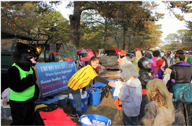
Truro Rec. at Trunk or Treat, Wellfleet