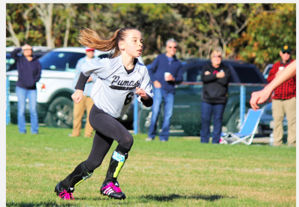
Truro Rec. Youth Soccer - Girls 3 | 4 Truro v Harwich