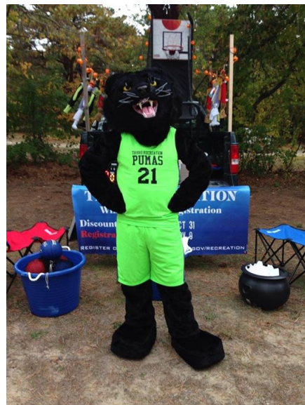
Truro Rec's New Mascot Was Spotted at Trunk or Treat in Wellfleet.