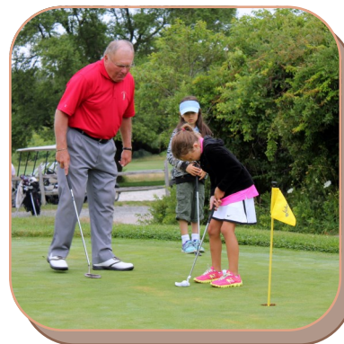
Youth Golf Lessons