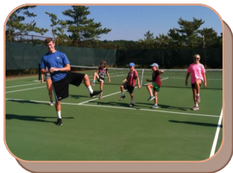
Youth Tennis Lessons