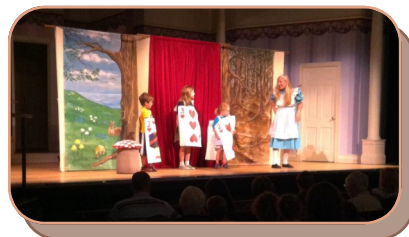
Cape Playhouse Field Trip