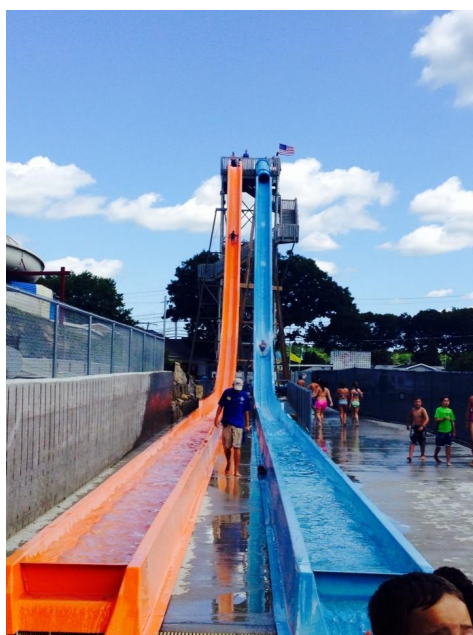
Some Summer Rec participants racing down the new slides at Water Wizz!

The Summer Rec. program is offered to children age 5 - 14, (Children's Program 5-11, Teen Program 12-14) residents and non-residents. At the Summer Program we strive to provide a safe and supervised environment that encourages friendships, physical activity, learning, and fun. Our different activities aim to nourish interactions between old faces and new faces, younger children and older children, and all kids and staff members. For more information, including program dates, visit our web site at www.truro-ma.gov/recreation (Programs / Summer Rec)