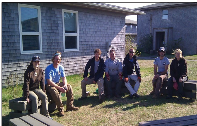
AmeriCorps members display the usefulness of their brand-new benches!