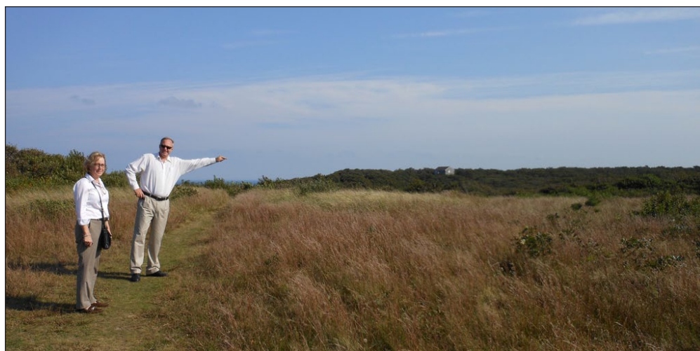
CCNS Park Planner Lauren McKean and Los Alamos National Lab Field Instrument Deployments Manager Kim Nitschke stand before the future site of ARM Mobile Facility.

From July 2012 to July 2013, the ARM Mobile Facility will operate from the Highlands Center to measure clouds, water vapor, aerosols, solar energy, and atmospheric radiation. There will also be weather balloons equipped with radiosonde telemetry packages, consistent with National Weather Service requirements, launched four times per day throughout the year. Complementing the ground-based measurements, instrumented aircraft will conduct intensive research flights over the site in July 2012 and