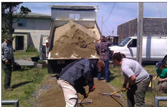
The ARC Lab Classroom's front walkway gets a 'facelift' with a fresh dressing of gravel.