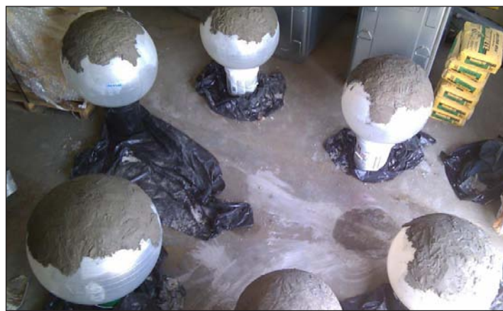
A few of the globes in mid-construction await their next layer of cement. Come paint them with us at Highlands Fest!