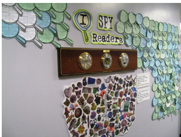
The I SPY READERS wall in the library

But there is much more reading to do! If, as a school, 1,000 books are read by the end of May, everyone gets a special prize! In the past, these all-school treats have included a giant ice cream sundae and class build-your-own pizza parties. This year's prize is still a surprise. A new clue is revealed on a giant scratch ticket each time 200 books are read. So far, one clue has been revealed—the letter E. Stay tuned for more clues. You can track our progress at www.truromass.org . Scroll down to find the I SPY Readers logo and click!